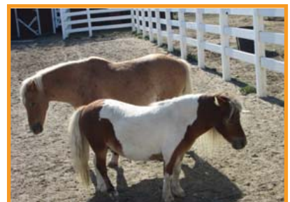
Horses on rescue ranch on Long Island