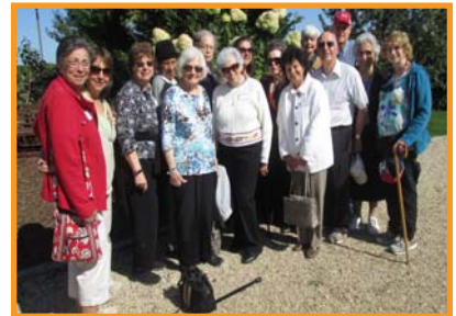
Baiting Hollow Farm & Vineyard-Tour Participants