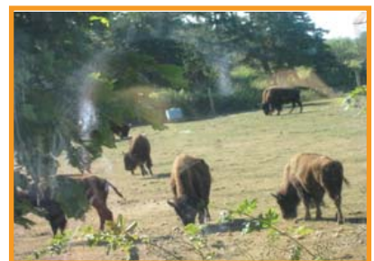
Bison Grazing on our Trip to Eastern Long Island