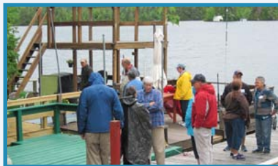
NZ members prepare to board motorized rafts from the dock at The Haven, Star Lake, NY after the June membership meeting