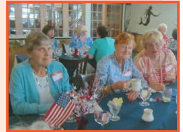
EERTA members at Flag Day luncheon in Mattituck